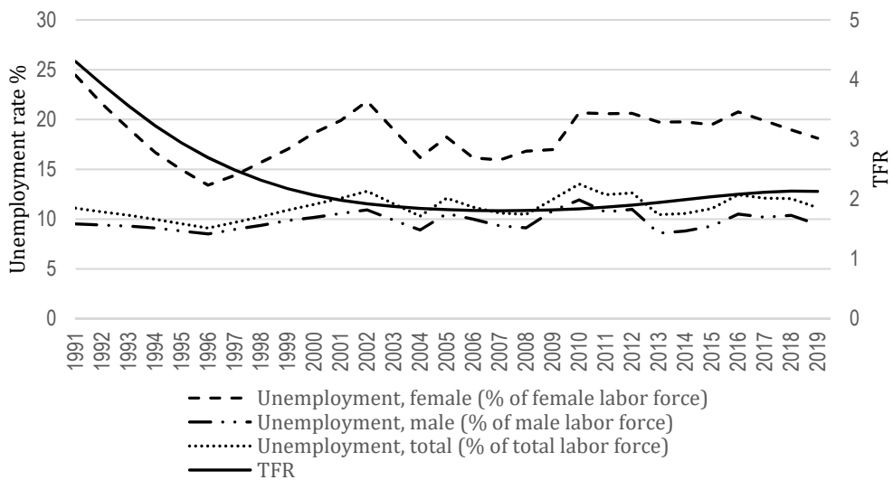
Graph 2. Unemployment Rate and TFR, Iran, 1991–2019 1

Dealing with sanctions has brought a huge loss to Iran’s economy. In the last decades, Iran has experienced negative GDP growth rates for several years, based on the World Bank statistics, the GDP growth rate of Iran has significantly decreased to -6,7 % in 2019. GDP per capita current US$ has decreased to 5,550 US$ and GDP per capita PPP has decreased to 12,937 US$ in 2019. In addition, the inflation rate has drastically increased from 7,6 % in 1990 to 40 % in 2019. This means Iran is dealing with huge economic problems besides an unfavorable social atmosphere. However, one of the main problems is the high unemployment rate in the country [54].